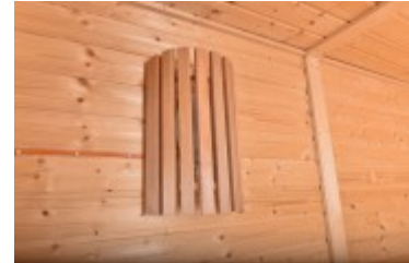
Sauna Light Cover