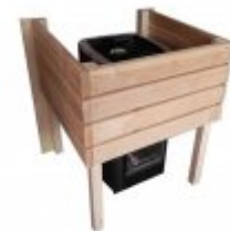
Heater Safety Fence for Woodburning Heaters