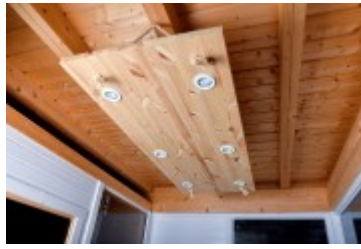
Ceiling Lamp for Sauna Cube***