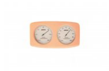
Thermometer - Hydrometer