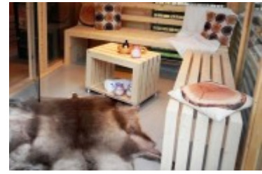
Table And Benches SET