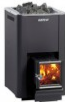
Wood burning heater Harvia SL 20 (outside feeding), 24.1 kw (8-20 m3)