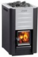
Wood burning heater Harvia Pro 20, 24 kw (8-20 m3)