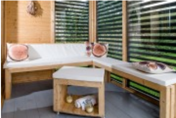
White Cushion Set for Benches and Table