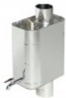
Water Tank For Woodburning Heaters