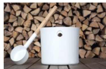
Bucket + Ladle Duo White

* - The rainwater pipe package includes straight gutter and all parts needed for installation. Down pipe package includes 2.5 m down pipe and all parts needed for installation. No need for exact measurements and calculations and easy to transport and install, as all components needed are packaged compactly in a single package, ensuring safe delivery and easy installation.