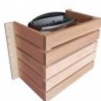
Heater Safety Fence for Electric Heaters