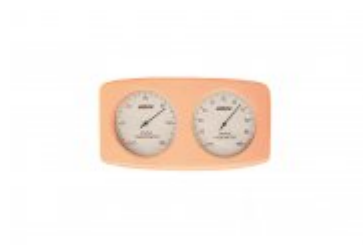
Thermometer - Hydrometer