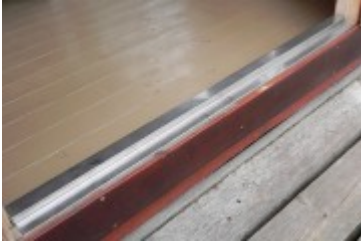
Stainless steel door sill

* - The rainwater pipe package includes straight gutter and all parts needed for installation. Down pipe package includes 2.5 m down pipe and all parts needed for installation. No need for exact measurements and calculations and easy to transport and install, as all components needed are packaged compactly in a single package, ensuring safe delivery and easy installation.