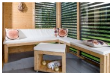
White Cushion Set for Benches and Table