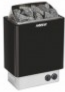
Electric heater Harvia Trendi KIP90, 9 kw (8 -14 m3)