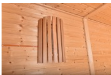
Sauna Light Cover