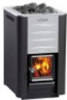
Wood burning heater Harvia Pro 20, 24 kw (8-20 m3)