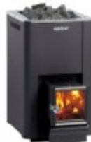
Wood burning heater Harvia SL 20 (outside feeding), 24.1 kw (8-20 m3)