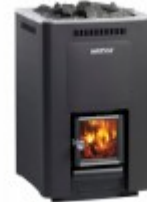
Wood burning heater Harvia 36, 31 kw (14 - 36 m3)