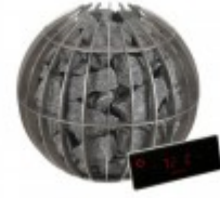
Electric heater Harvia Globe GL110, 10.5kw (9-15m3)