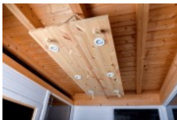
Ceiling Lamp for Sauna Cube***