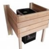
Heater Safety Fence for Woodburning Heaters