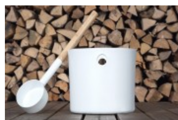
Bucket + Ladle Duo White