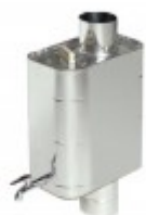
Water Tank For Woodburning Heaters